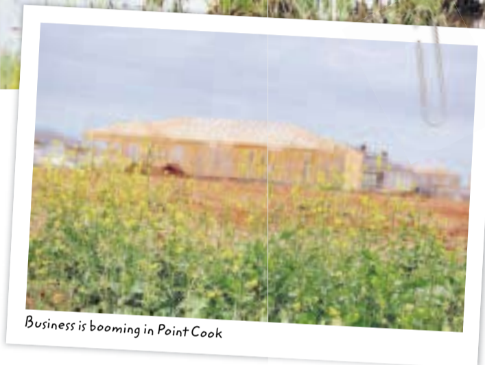
Business is booming in Point Cook

"There is still strong demand, and this recent release (stage three) has some of the largest lots in Point Cook; up to 1270sqm," Michael says. "The stage three Skeleton Creek/wetlands-facing lots are set in their own little enclave." As well as wetlands/watercourse-