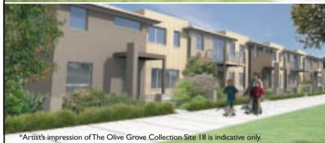
*Artist's impression of The Olive Grove Collection Site 18 is indicative only.