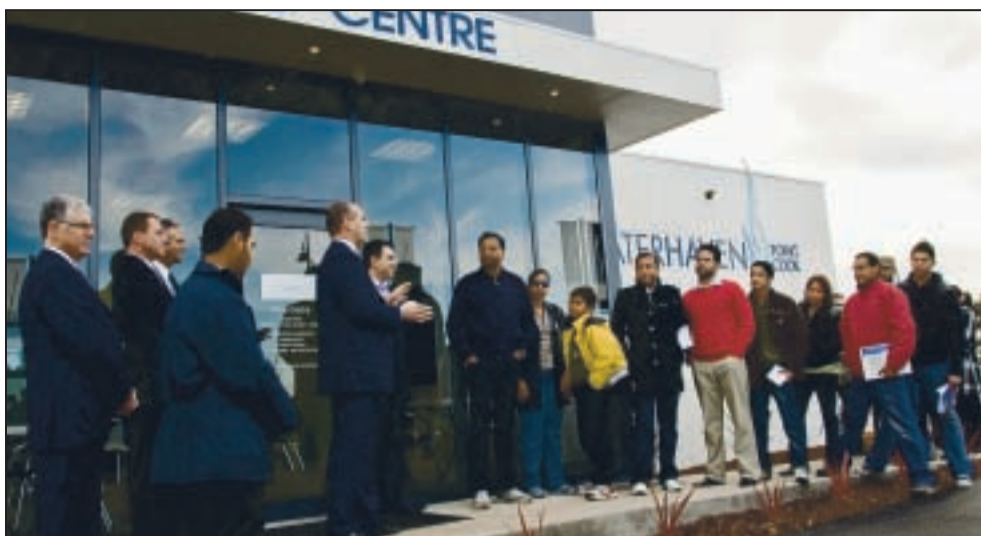
Keen buyers camped out overnight to ensure they got a block.