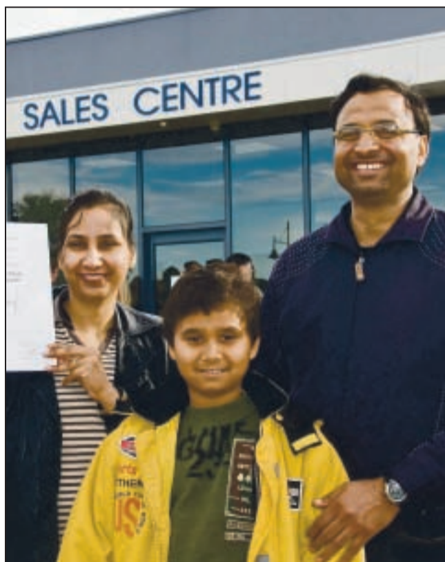
The Aggarwal family was the first to secure a block of land at Waterhaven.

Point Cook is one of Melbourne's fastest