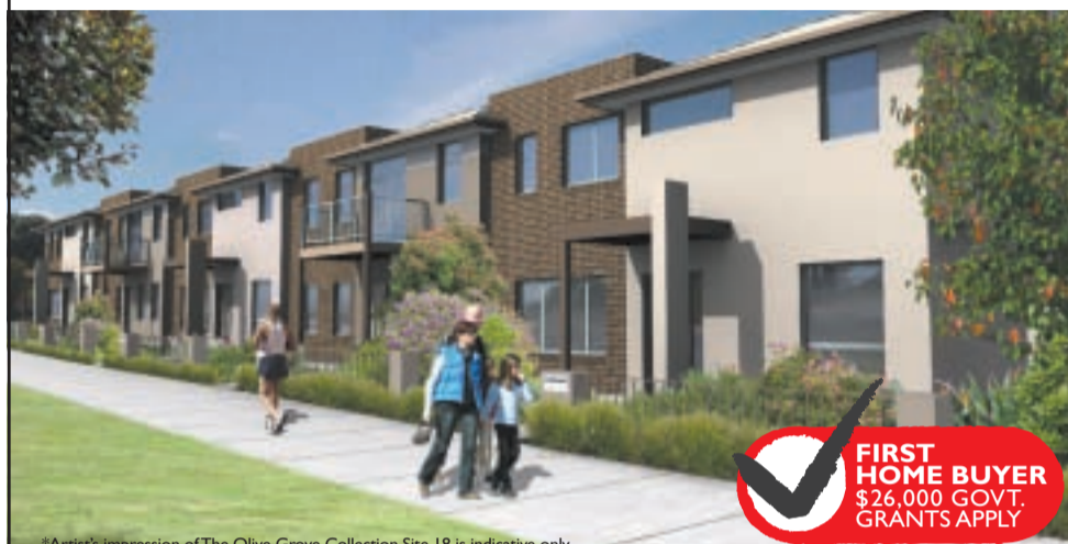
*Artist's impression of The Olive Grove Collection Site 18 is indicative only.